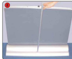
2 Lean the bannerstand backwards and extend the banner by lifting the top rail until the complete image is visible.