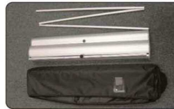
Kit includes: base, bungee pole set and carry bag