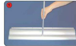
1 Assemble the bungee pole and insert into the base.