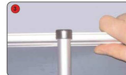
3 Finally secure the banner by locating the top rail cup over the pole.